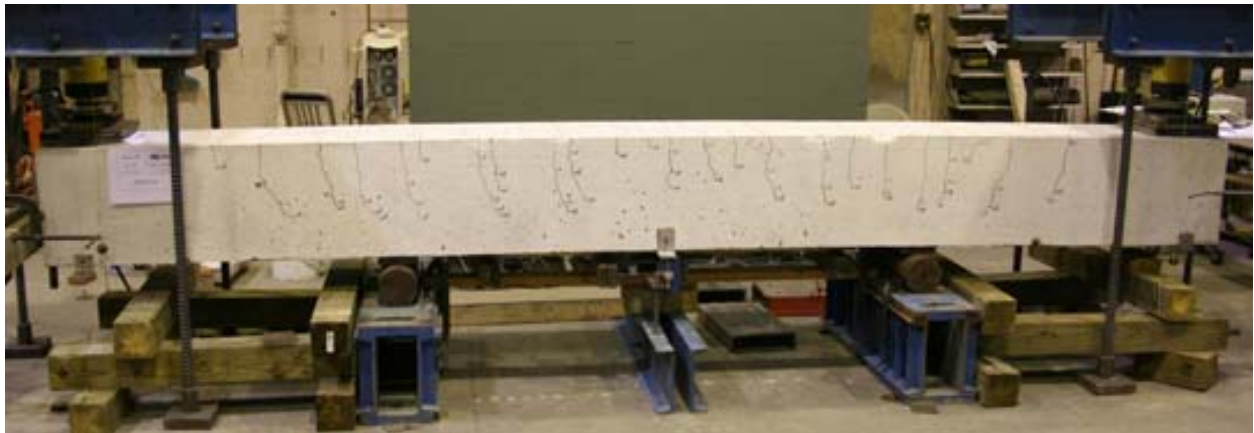
Reinforced concrete beams are being tested to evaluate lap splice lengths.