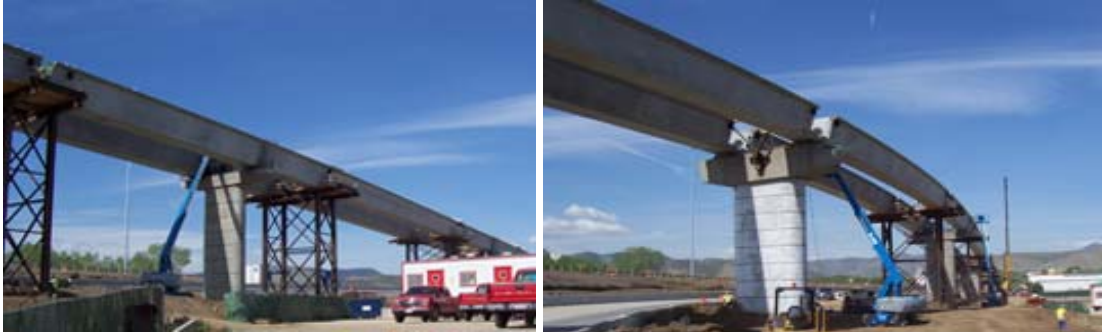
High strength, flowable concrete was used in the curved and straight girders.