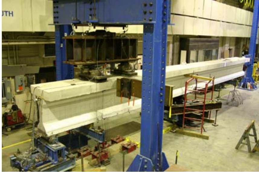
Strand development length test of LWHPC beam.