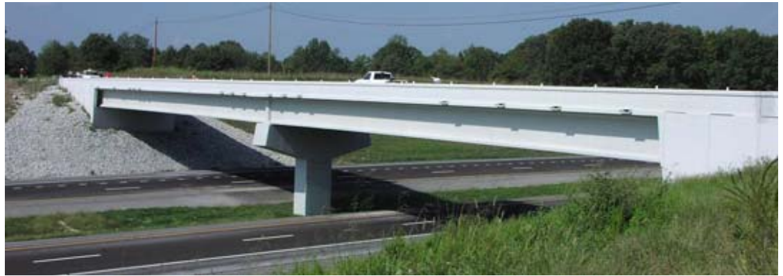
HPC was used in the superstructure of the Hickman Road Bridge, TN

Any opinions, findings, and conclusions or recommendations expressed in this publication are those of the Author(s) and do not necessarily reflect the view of the Federal Highway Administration.