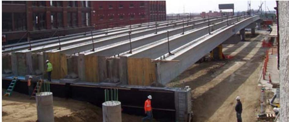
Self-consolidating concrete with a compressive strength of 12,000 psi (83 MPa) was used in the beams of the Harris Overpass, Lincoln, NE.