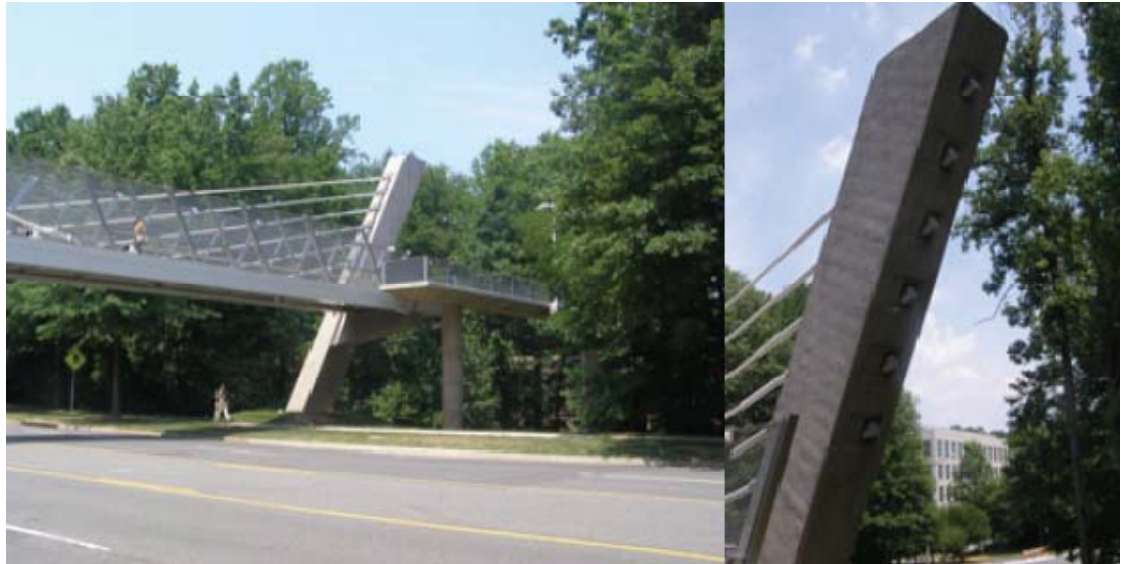
SCC was used in the inclined pylons of the cable-supported pedestrian bridge, VA.

Any opinions, findings, and conclusions or recommendations expressed in this publication are those of the Author(s) and do not necessarily reflect the view of the Federal Highway Administration.