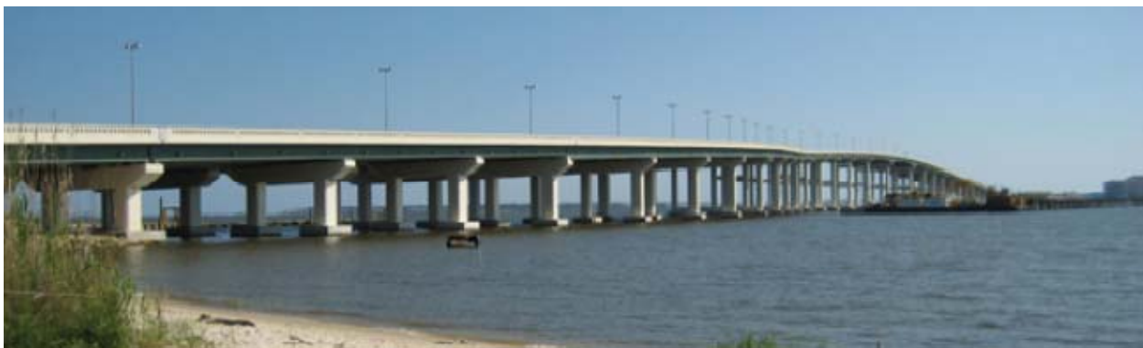
Self-consolidating concrete was used in the precast, Prestressed concrete beams of the new Biloxi Bay Bridge.